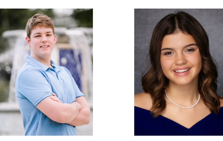
PETER GRAY MACLAY SCHOOL | Philippians 4:13 |