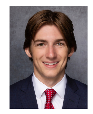
AIDEN MERRITT MACLAY SCHOOL | Psalm 121:1-2 |